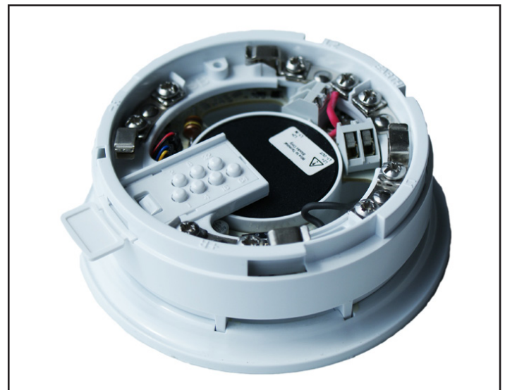
Part no 45681-702 - Discovery Sounder Base